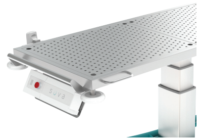
Perforated Top 4H805PS