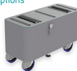
Fabric Skirt 4H860S Colour options available